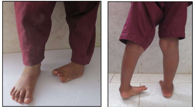
Clinical Photographs of an eight-year old boy showing left neglected clubfoot 2 years after treatment of manipulation and serial casting for 3 months (Nine casts and Tendo Achilles lengthening)