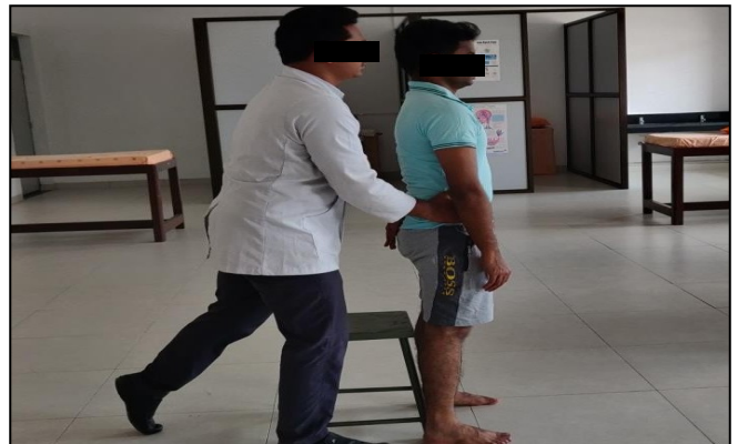
Picture III: Mulligan mobilization for anterior innominate dysfunction in sit-to-stand position