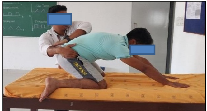
Picture III: Mulligan mobilization for anterior innominate dysfunction in sit-to-stand position